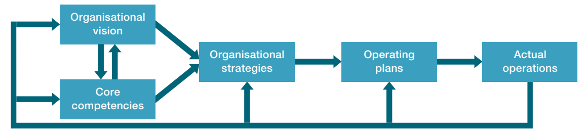
Measure, monitor and motivate

People at different levels within an entity continually make many different kinds of decisions. These range from long-term decisions, such as which markets and customers the organisation will pursue, to detailed operational and short-term decisions, such as how to respond to specific customer enquiries on a day-to-day basis. Figure 1.1 presents an overview of the decisions that managers make in organisations. It also suggests the role that information systems have in measuring, monitoring and motivating performance. We will briefly discuss each of the components illustrated in figure 1.1.